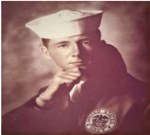
United States Navy, 1967-1971