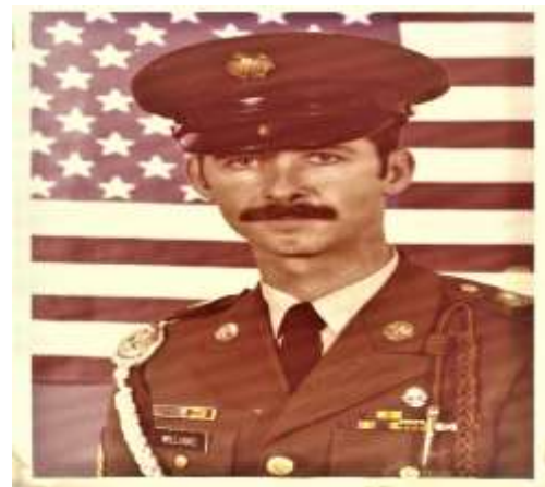
United States Army, 1974-1978